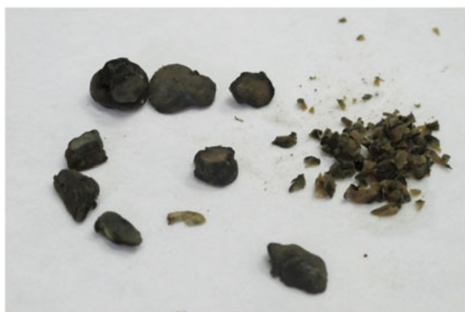
Figure 1. Sclerotia (or truffles) seized by the Italian anti-adulteration and safety bureau police.

Fourteen different sclerotia (or truffles) (for a total weight of 10.3 g, with each single sclerotia weighing from 0.5 to 2 g; Figure 1) seized by the Italian anti-adulteration and safety bureau police (Carabinieri per la tutela della salute- NAS) were received at the Istituto Superiore di Sanità to be analyzed for the presence of eventual psychoactive compounds. These truffles were sampled by the safety bureau police at the time of seizure from different plastic packs found together with other plastic packs containing unknown tablets and capsules in private houses during a search as a part of an investigation coordinated by the Anti-Mafia District Directorate of Catania Public Prosecutor.